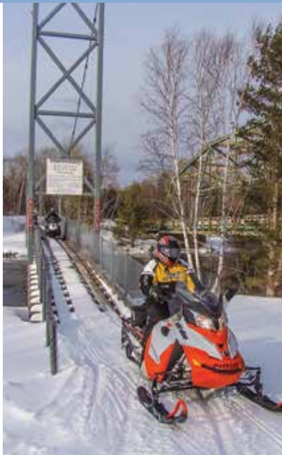
The Wiley suspension bridge takes riders over the West Branch of the Penobscot River just west of Millinocket.

After passing through the edge of historic Millinocket – founded as a mill town in 1901 – we turned north on Interconnected Trail System trail