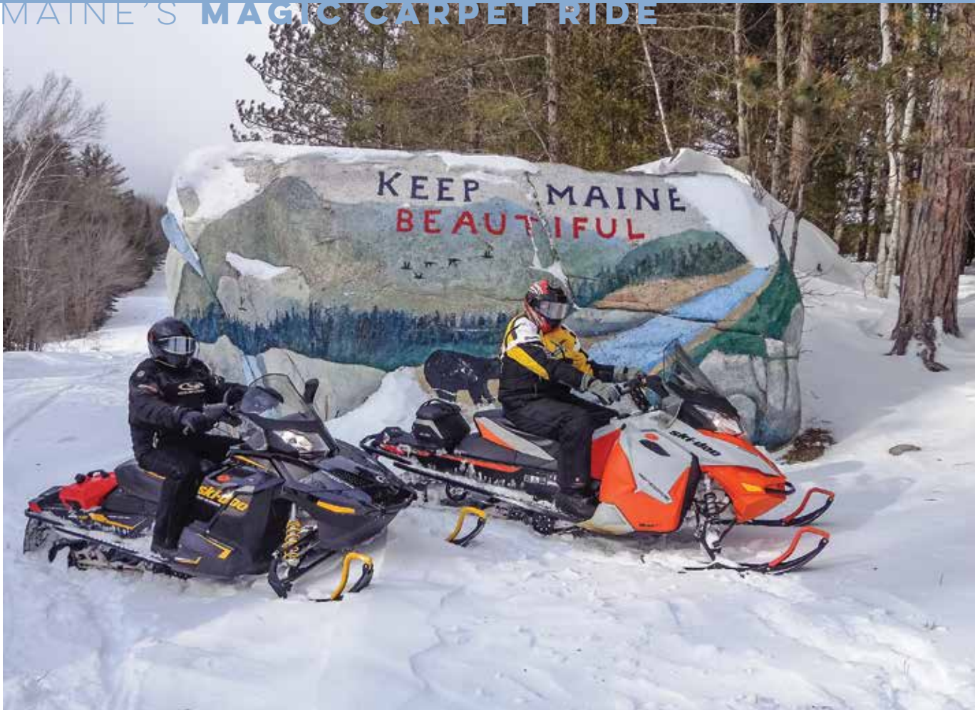
The big painted rock (above) near the entrance of Baxter State Park was even more beautiful than normal with the corners painted with fresh snow. And fresh snow wasn't a problem, as seen at the picnic shelter (right).