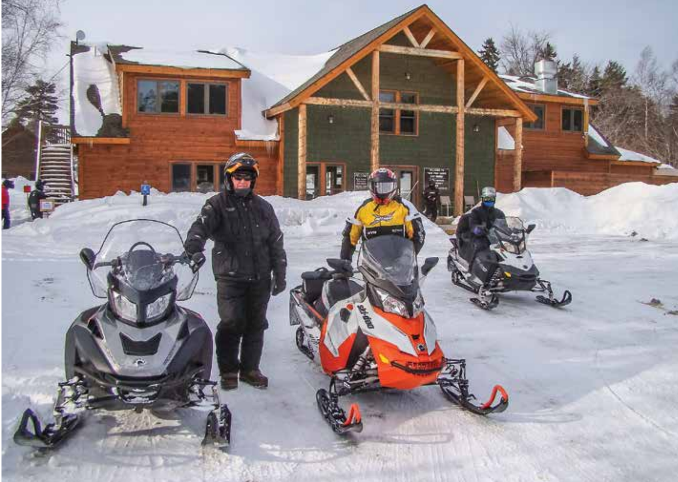
The New England Outdoor Center (above) is a year-round recreational headquarters for all kinds of outdoor activities, including snowmobiling. In the aftermath of an overnight blizzard, blowing snow swirls around the sleds alongside the 5 Lakes Lodge (right) prior to the day's ride.

that area is honeycombed with trails. As president of the Jo Mary Riders, I deal with the other three companies – Katahdin Forest Management, Prentiss & Carlisle and Wagner Forest Management. I've been very fortunate over the years to develop a wonderful working relationship with the land managers and foresters of all three companies. As a club, we never do anything without asking permission first and whenever they ask us to do something we get it done as quickly as possible. Our respect for their land has allowed all area clubs to have and maintain hundreds of miles of trails in the Katahdin region and beyond."