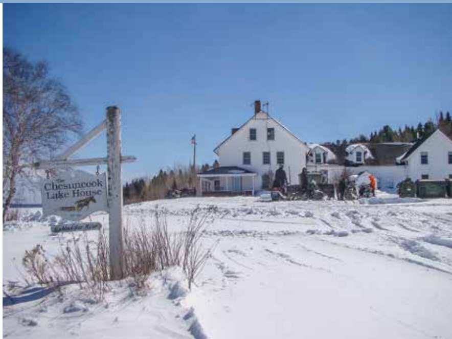
The Chesuncook Lake House is a popular stop for snowmobilers on the north end of Chesuncook Lake.

After savoring a delicious bowl of chunky New England clam chowder, it was time to hit the trail again for the homeward journey back to the 5 Lakes Lodge. Our route took us past Millinocket Lake and featured several sections of roller coaster riding along a series of power lines as we cruised through a mixed forest of hardwood and conifers. On the way, we visited the New England Outdoor Center, where we made a dinner reservation for later that evening. We returned to the lodge at sundown after a circuitous, 94-mile excursion.